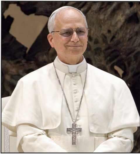
Pictured is our Holy Father, Pope Leo XIV

In his message for the 59th World Day of Peace, Pope Leo XIV speaks of a peace that is “unarmed and disarming.” A peace not built on force or control,